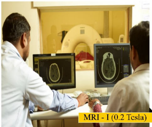
MRI - I (0.2 Tesla)