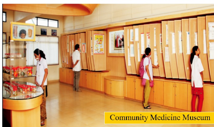
Community Medicine Museum