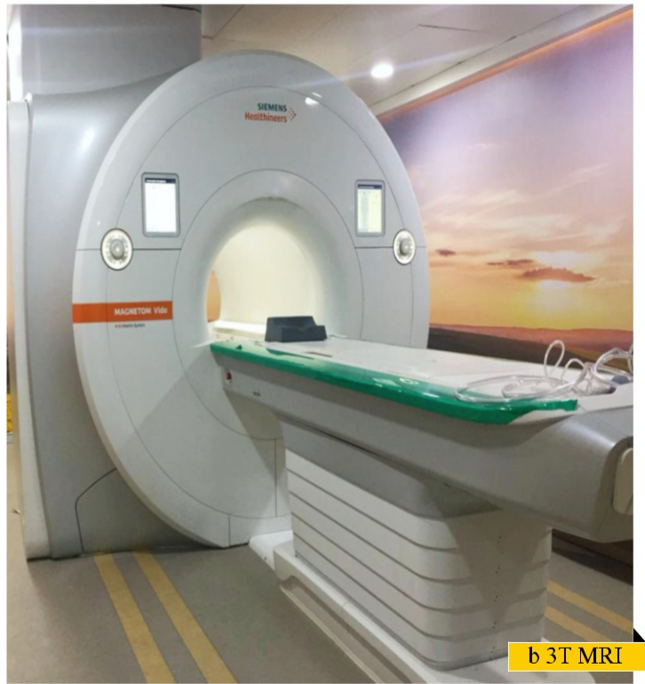
b 3T MRI