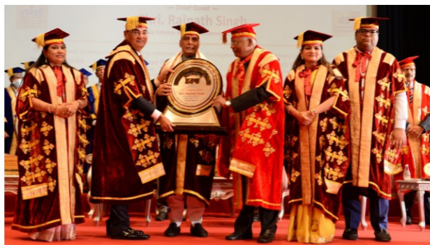
Felicitation of Chief Guest Shri. Rajnath Singh Defence Minister, Government of India