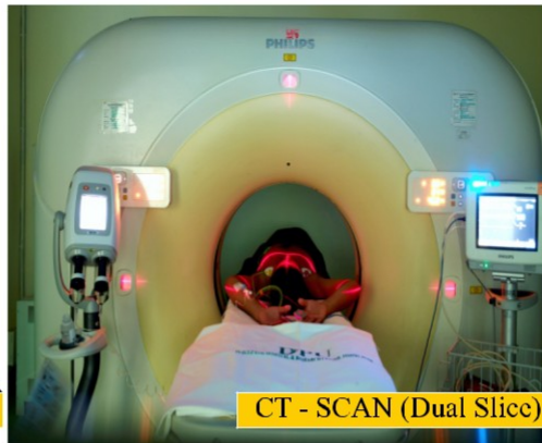
CT - SCAN (Dual Slice)