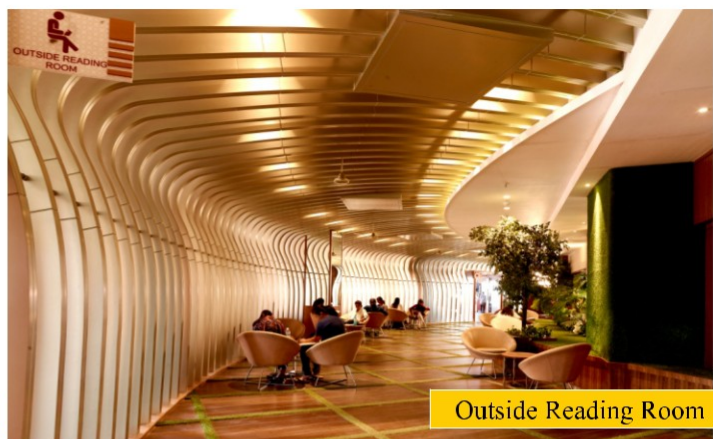
Outside Reading Room